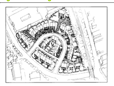
Figure 3: Design scenarios from the London SRQ study

Typical sites are selected and subjected to design exercises. These can be used to explore different policy and density scenarios with regard to parking provision and layout. For example, in the SRQ study (illustrated below), one scenario applied existing local plan parking and density standards, a second reduced the parking expectation, enhanced the design, and increased densities, and a third (that assumed highly accessible locations) removed parking altogether. The study found that parking had a profound influence on potential densities to the extent that the second scenario increased densities by 50% and the third doubled them.