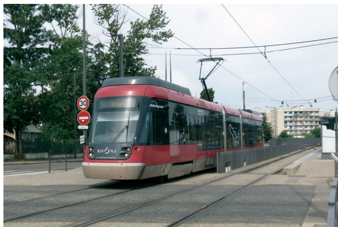
▲ A Stadler Tango low-floor LRV on the Rhônexpress service from Lyon to Lyon Satolas Airport passing Decines Grand Large.