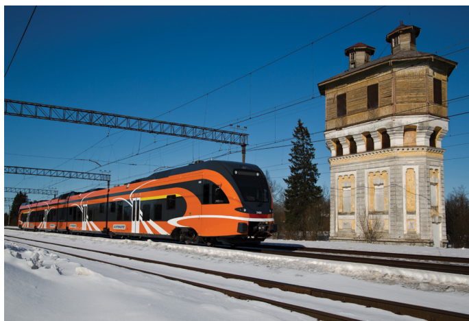
▲ A Stadler FLIRT low-floor DMU as delivered to Estonian railway operator Elron.