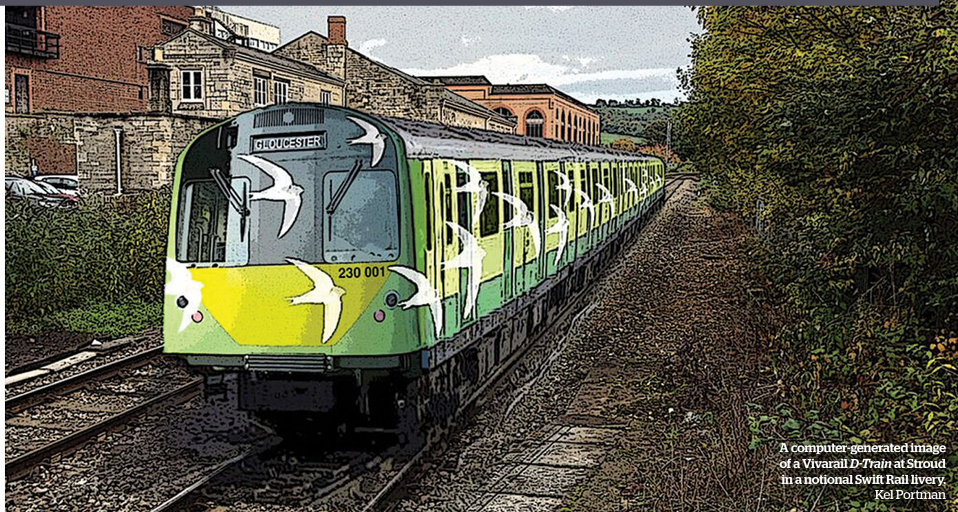
A computer-generated image of a Vivarail D-Train at Stroud in a notional Swift Rail livery. Kel Portman

The UK could learn from Germany and its own experience in London's Docklands when it comes to rail transport links, argue Nicholas Falk and Reg Harman.