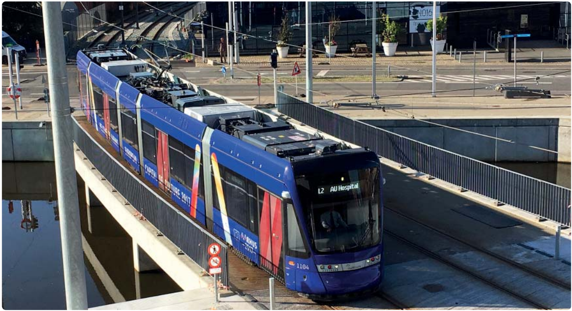
The Aarhus Metro—Denmark offers good models of land value capture, and demonstrations of its benefits

system of British politics renders long-term planning difficult, making it almost impossible to develop the markets and expertise found on the European mainland. This leads to unfeasible proposals such as those found in Cambridge and Bristol, where underground tunnels have been proposed as a way of overcoming opposition. Hope is placed on ingenious and impractical ways to cut costs, rather than on integrating transport and development plans and funding.