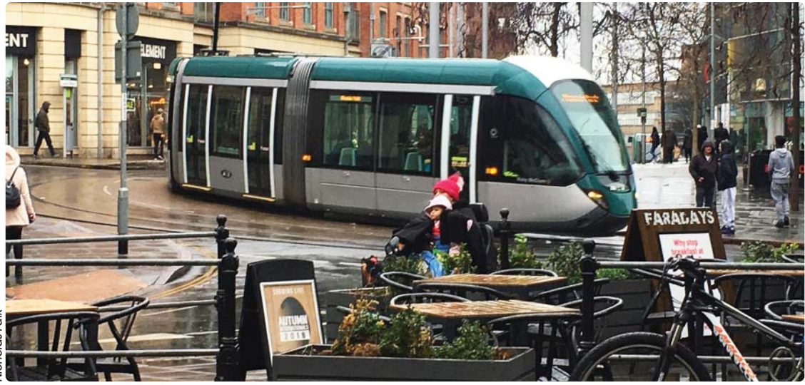
A Nottingham Express Transit tram in Nottingham city centre

Calls for greater equality or levelling up can never be met without long-overdue changes in the way that we plan and deliver local infrastructure projects, says Nicholas Falk