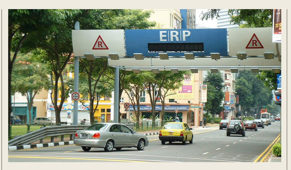
Electric Road Pricing toll collection scheme adopted in Singapore to manage traffic

transport, active over passive transport, like bikes and walking, and the 'Omnibus' over the autonomous vehicle. A useful review of the literature with 89 references distinguishes between technology factors that favour integration, human factors that favour learning, and institutional factors that favour good governance<sup>9</sup>.